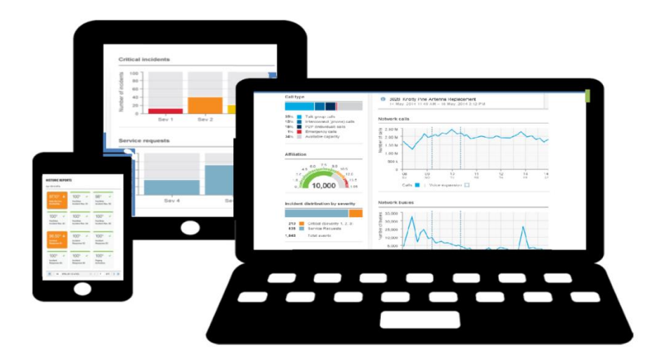
Figure 1-1: MyView Portal offers real-time, role-based access to critical network and services information.

To provide EBRCSA with quick access to service details, Motorola Solutions will provide our MyView Portal online network information tool. MyView Portal provides our customers with real-time critical network and services information through an easy-to-use graphical interface.